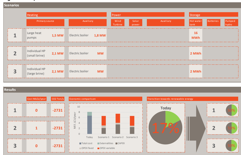
Figure 1: Output module of the Excel decision tool

We start with the outputs of the tool to give you an understanding of what information this tool can provide.